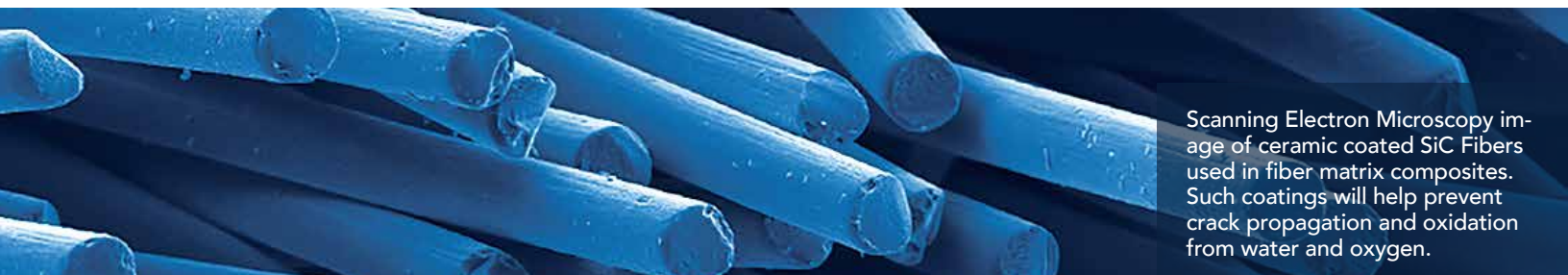
Scanning Electron Microscopy image of ceramic coated SiC Fibers used in fiber matrix composites. Such coatings will help prevent crack propagation and oxidation from water and oxygen.